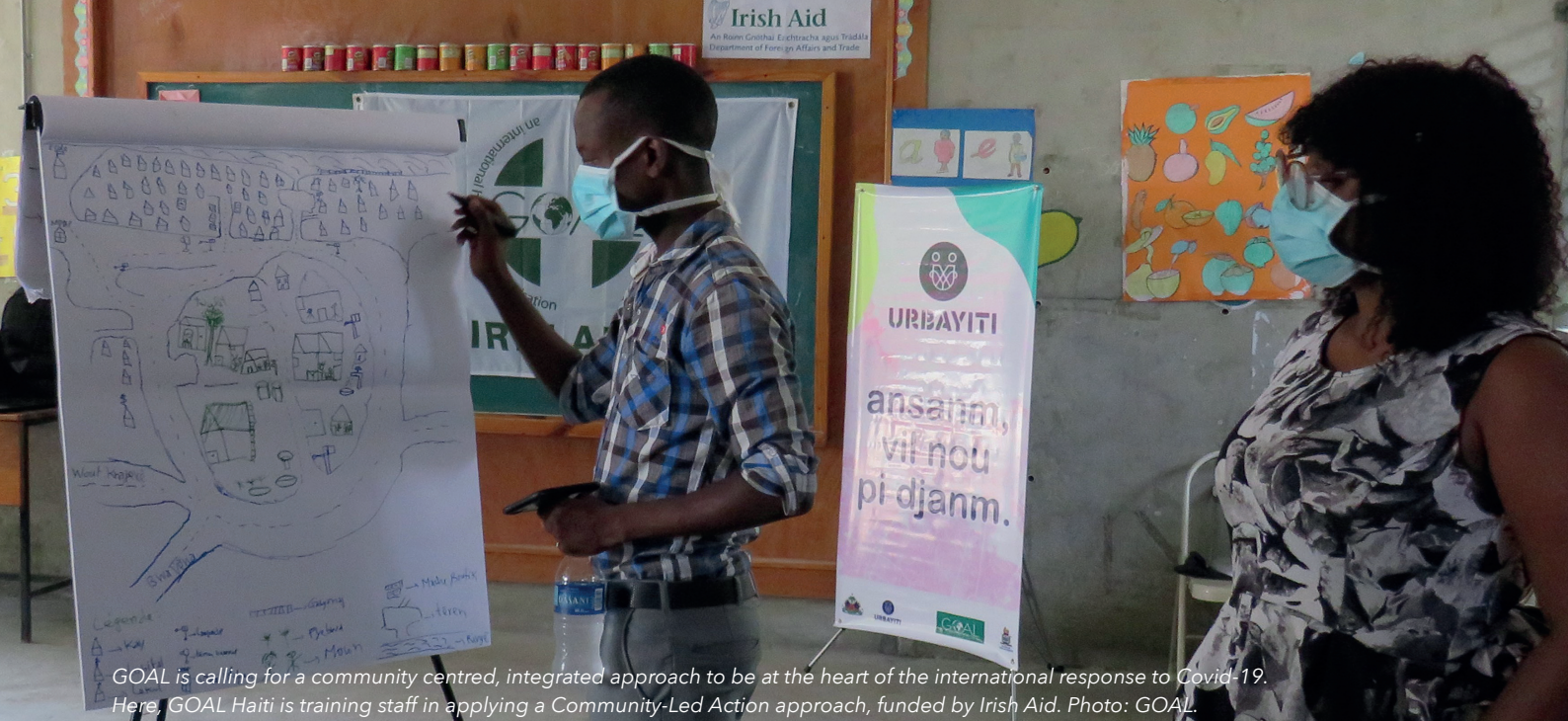
GOAL is calling for a community centred, integrated approach to be at the heart of the international response to Covid-19. Here, GOAL Haiti is training staff in applying a Community-Led Action approach, funded by Irish Aid.