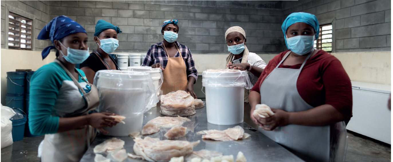
Livelihoods, Resilience and Economic Recovery: Young women work in the fish processing plant supported by GOAL's MiPesca programme in La Mosquita region, Honduras.

COVID-19 threatens to roll back the development gains which have been so hard fought for by the most vulnerable communities across the globe. The global recession has direct repercussions in GOAL programme countries, and its impact further exacerbates increasing rates of hunger and poverty, as well as challenges including the desert locust outbreak, early droughts, conflict and insecurity.