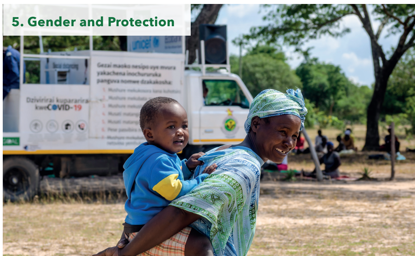
Gender and Protection: A young mother and her child in Bazel Bridge, outside of Mutare, Zimbabwe, where GOAL staff broadcast COVID-19 public health messaging from mobile loudspeaker units and using posters.

COVID-19 will exacerbate existing challenges for women and girls economically, physically, and socially 26 . The United Nations Population Fund Agency (UNFPA) has issued a stark and sober warning on the impact of COVID-19 will have on women and girls. It