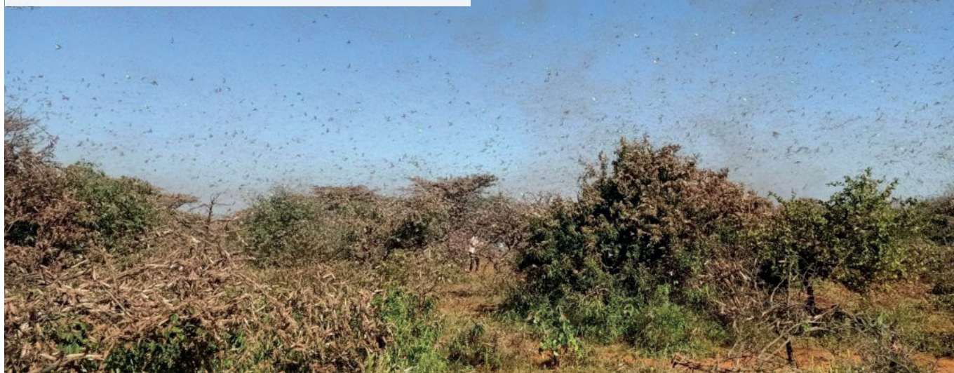
Food Security and Nutrition: A locust swarm in the Borena region of Ethiopia in mid-February of 2020.

The World Food Programme warns that the Covid-19 pandemic will see more than a quarter of a billion people suffering acute hunger by the end of the year 12 . Restrictions on movement within and across countries can hinder food-related logistic services, disrupt entire food supply chains, and affect the availability of food. Impacts on the movement of agricultural labour and on the supply of inputs are posing critical challenges to food production. The 2020 Global Nutrition Report warns that