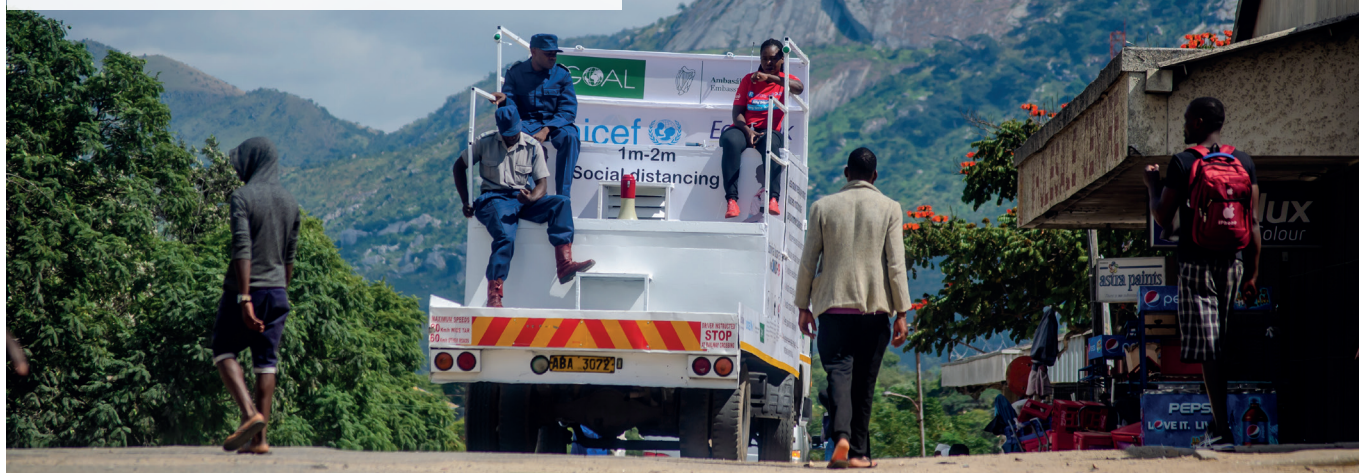
Health Response: GOAL staff distribute hand sanitiser and broadcast COVID-19 health messaging from mobile loudspeaker units in Mutare city, Zimbabwe.

Covid-19 has overwhelmed and stretched even the most well-resourced health systems in the world. In the world's poorest countries where health systems are chronically underfunded and understaffed, COVID-19 will present huge challenges. Health systems will require significant support to ensure they can continue to provide the services and treatments their communities need.