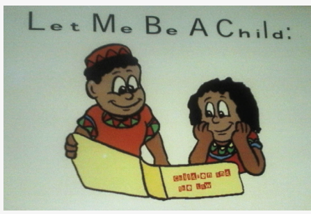
Excerpt from booklet produced by RCK to support monthly discussions with children on SEAH

Key staff have received introductory training on PSEA and participated in events on investigations.