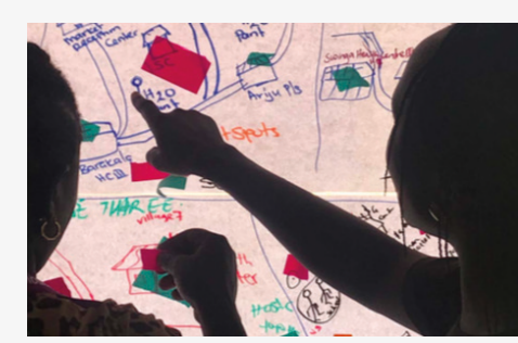
Women discuss a community risk map they have created in Uganda © The Global Women's Institute at the George Washington University.

Recommendations emerging from this research are listed below. The next phase of the project will put this information to use in demonstrating how contextual safeguarding approaches can be applied to aid distribution systems, and will include producing a 'toolkit' of resources that can be further adapted to fit other contexts.