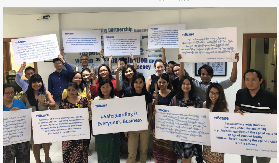
Safeguarding week in Myanmar