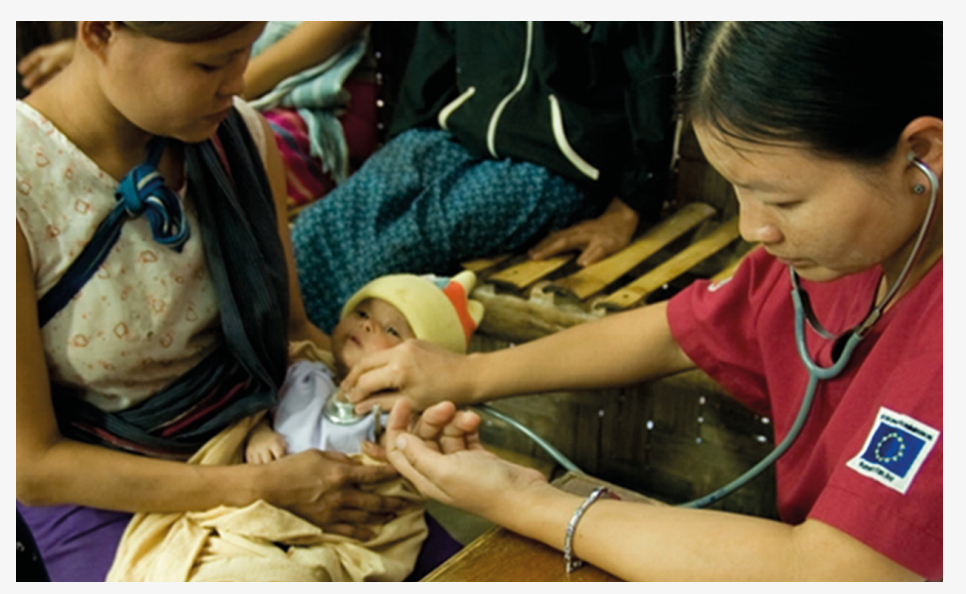
CCSDPT member agency staff at work