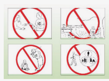
Some of the original designs....

There was a lot of feedback, which was all fed back to the country office. Some couldn't be taken into account, but most could. Text was also added to the images in the different local languages spoken where GOAL works. The images were then made into posters and displayed wherever possible – at the country office, in warehouses, in field offices, and so on.