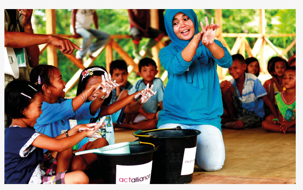
YEU public health programme in Mentawari Island