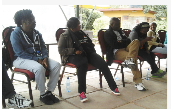
Workshop on PSEA code of conduct

RCK provides legal aid services and psychosocial counseling; advocates for policy change and raises awareness on the rights of refugees. The organisation works in Nairobi and urban centres and in camps hosting refugees.