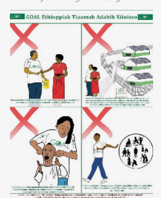
...and the finished version