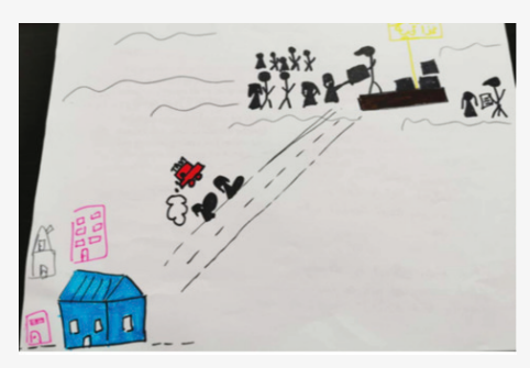
A risk mapping of a distribution site in Lebanon created by women and girls © The Global Women's Institute at the George Washington University.

In Lebanon, GWI partnered with CARE International. Together they undertook